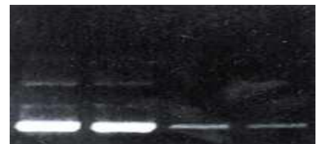
pUC19 plasmid with a 10kb insert: TB (lane 1 and 2) LB Broth (lane 3 and 4)