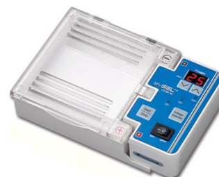
myGel™ Mini Electrophoresis System