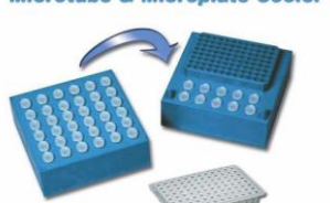
CoolCube™ microtube and PCR plate cooler