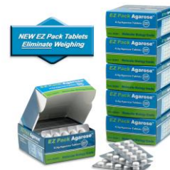
EZ Pack™ Agarose Tablets