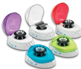
MyFuge™ Mini Centrifuge